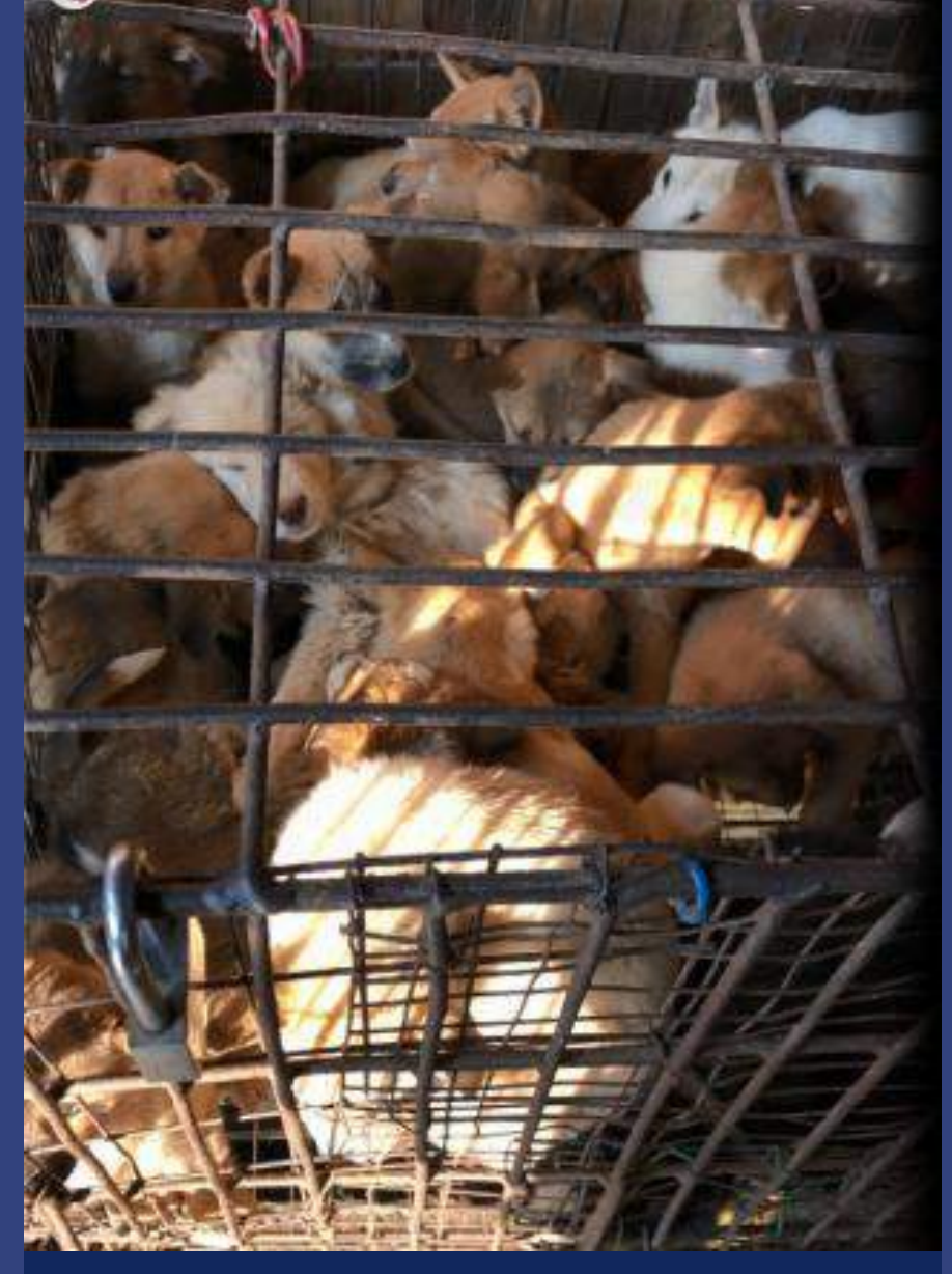
Dogs are crushed in a small cage