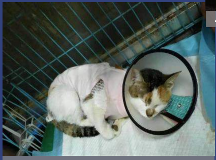
a cat after surgery

the rest have been released to their original habitat.