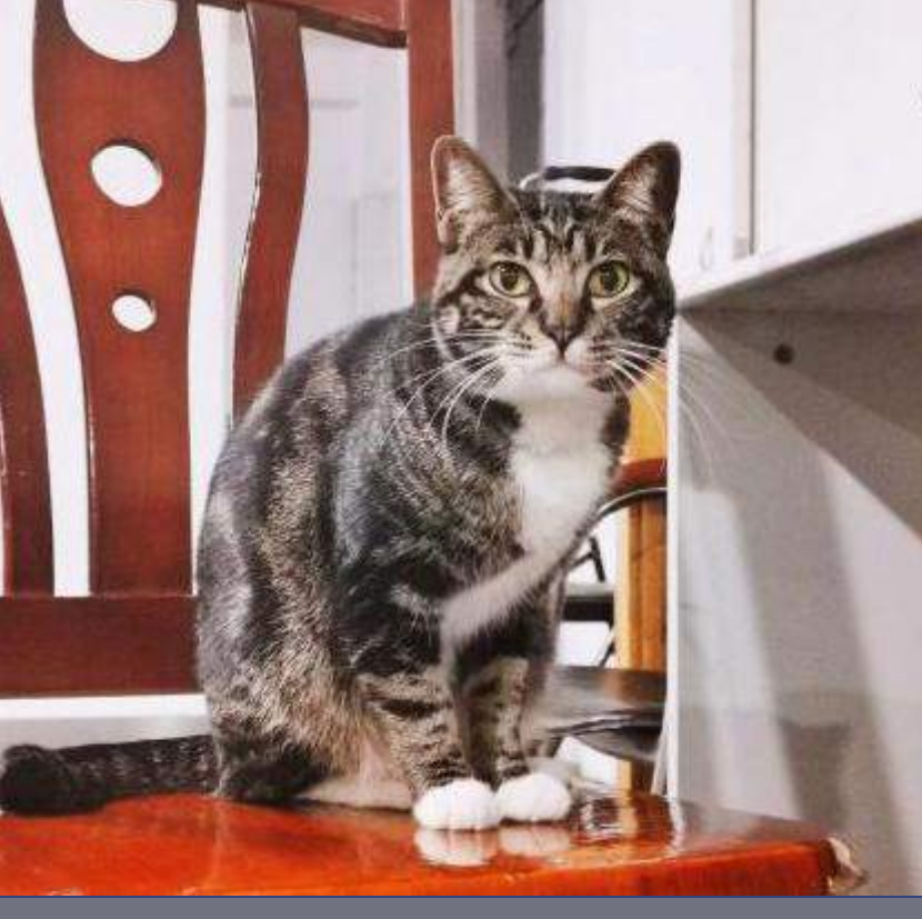
A cat adopted after TNR