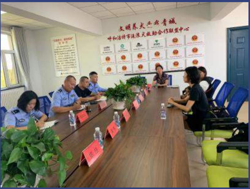
Visiting Hohhot's government shelter and speaking with the officials