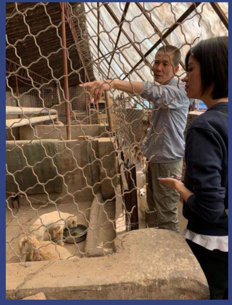
Visiting Hohhot's NGO