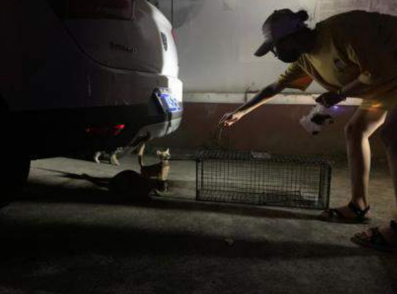
A volunteer is trying to tempt a cat into the cage