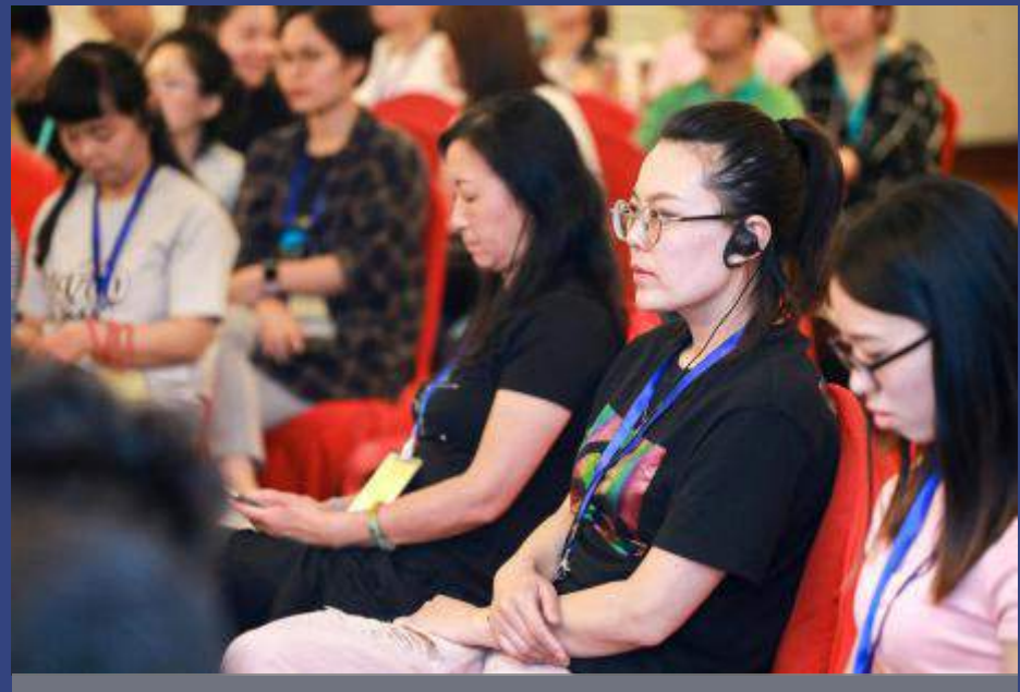
Audience listening to English speech with simoutanious interpretation service