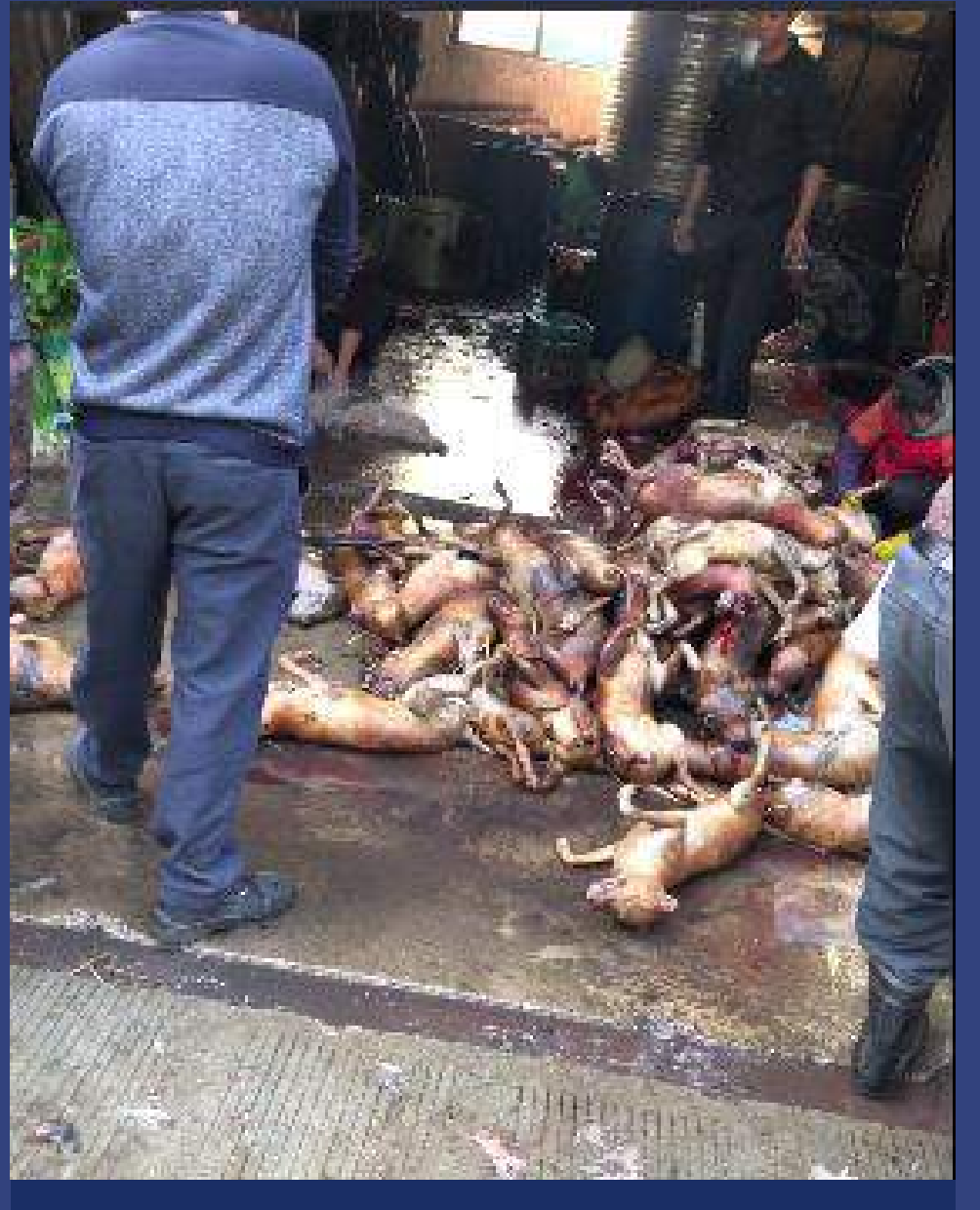
The processed dogs are piled up on the ground

Based on our observation, the dog meat consumption is still thriving in Guangxi region, not only in Yulin city, dog meat is sold in markets in 75% of our visited are a. 2 large scale slaughter locations in Liuzho U city and Guilin city slaughter over 1000 dogs daily.