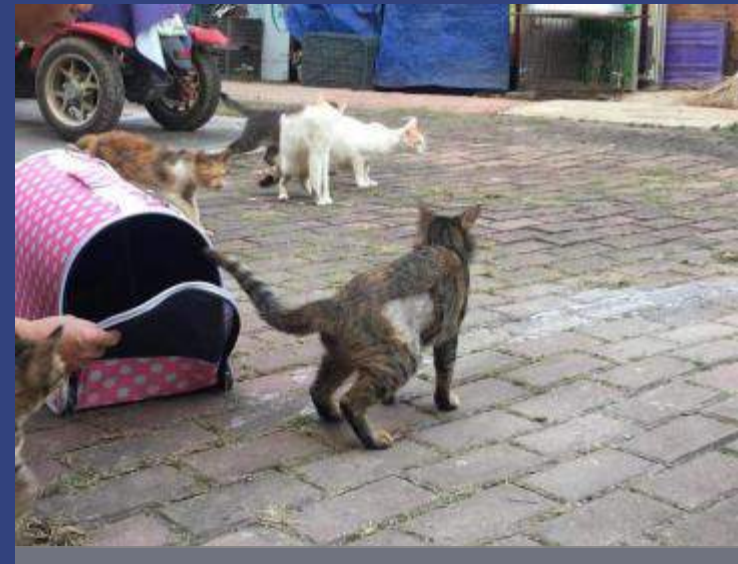
Cats released back to where they were found