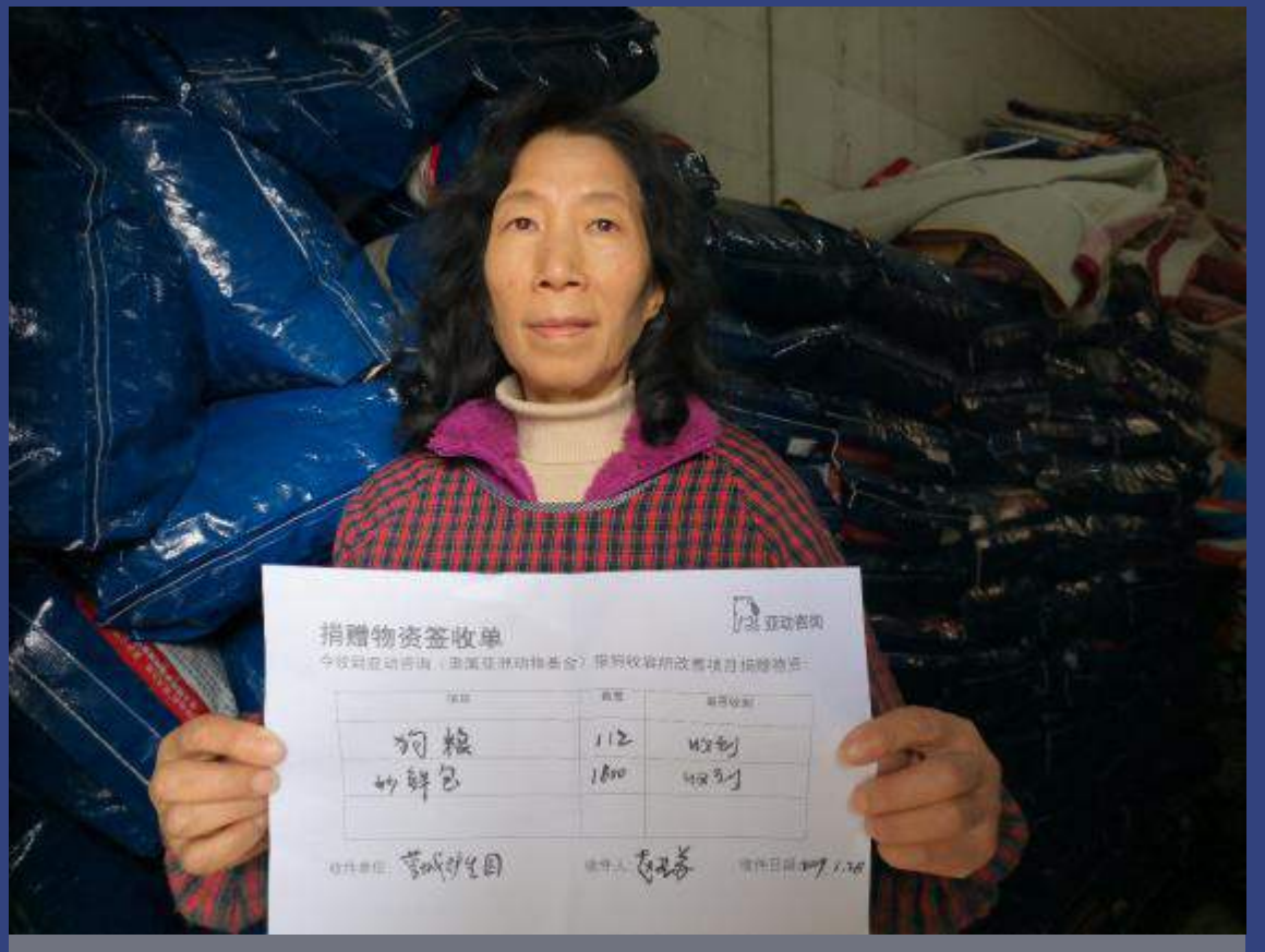
a volunteer of Rongcheng nursing garden received our donation