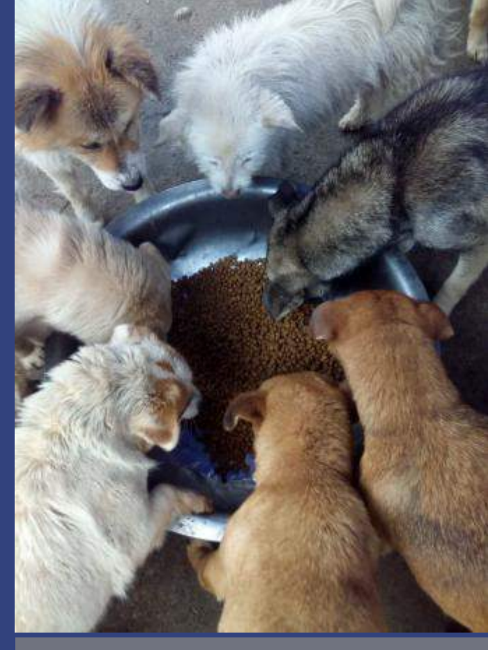
Dogs are enjoying their new year's eve meals