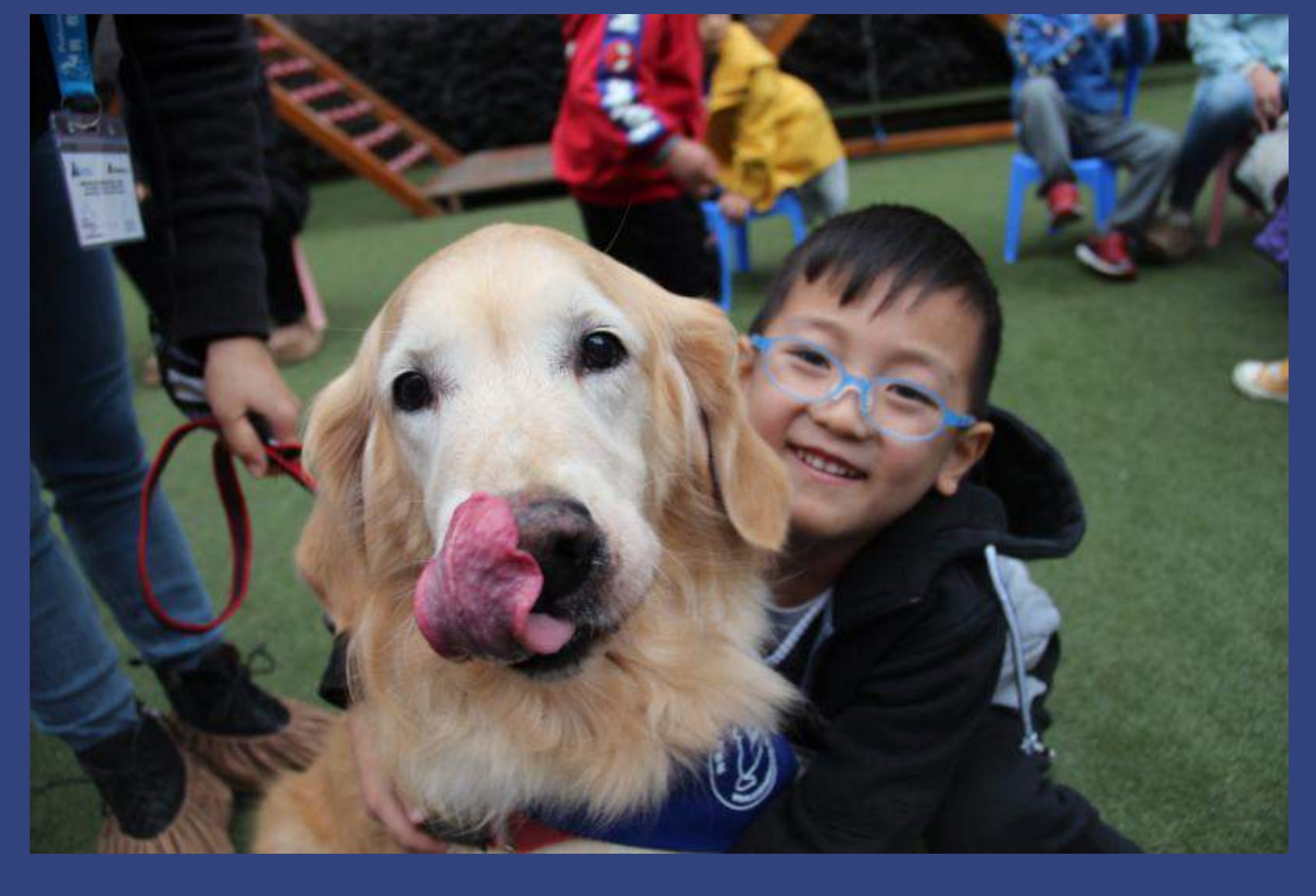
Cat and Dog Welfare 2019 Annual Review